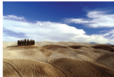
The flat of Chiusa in summer.