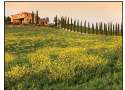
The traditional yellow Colsa flower blooms profusely in spring.