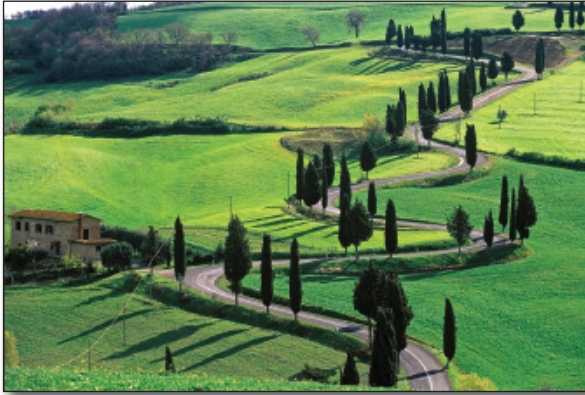
The snaking, ancient roadway near Monticchiello, Val d'Orcia.