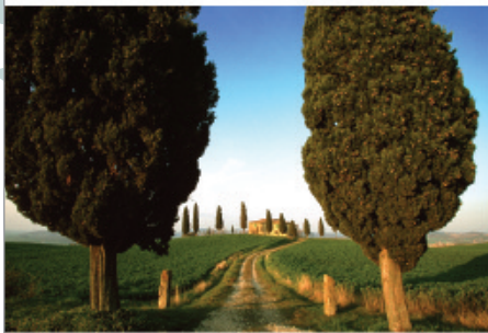
Two cypresses frame the eye into a characteristic Tuscan spring scene.