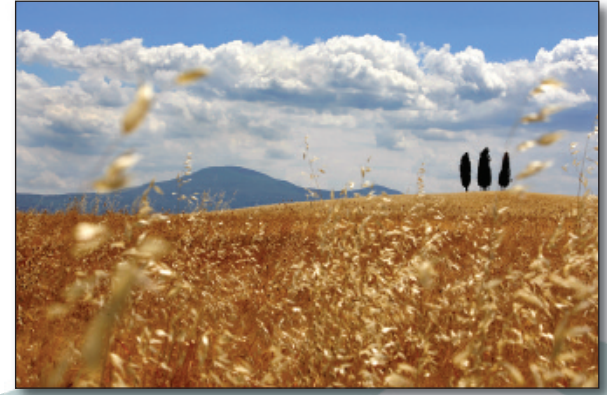
Ripe corn under a baking Tuscan sun.