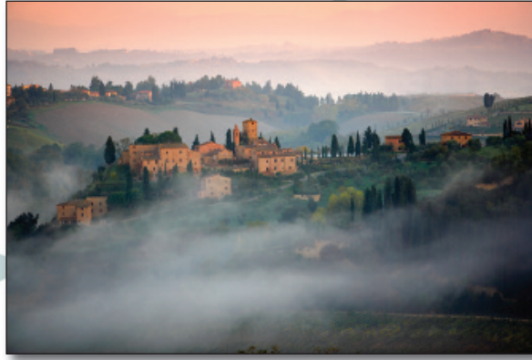
The medieval hamlet of Castel di Tonda near Castelfalfi in the Era valley.