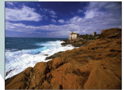
A more placid spring sea. The Calafuria coast of the Tyrrhenian Sea.