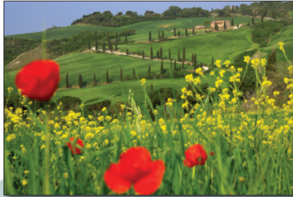
Colsa and poppies form a colourful foreground to this switchback Tuscan road.